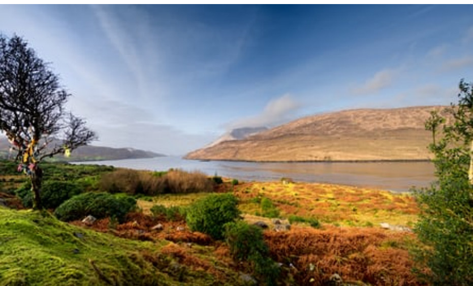
Area surroundings the hostel.