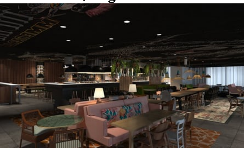
Rendering of Mama Shelter, Belgrade

Doubles from €129 room-only (opening rate of €99 until 31 March)