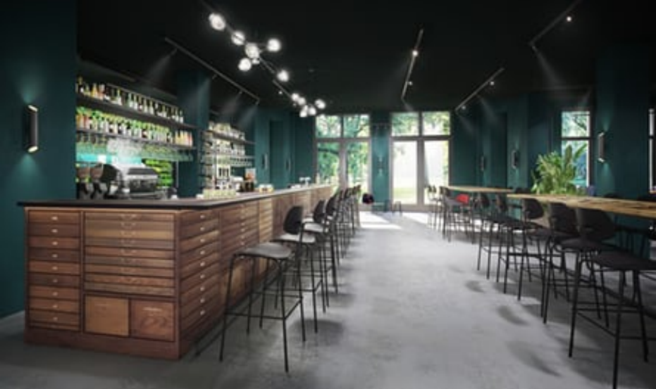
Rendering of the Conscious Hotel Westerpark