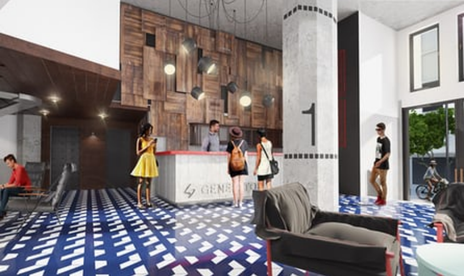
Rendering of the Generator hostel