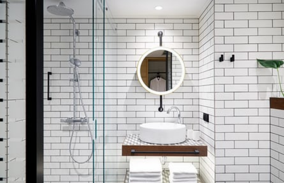
The Puro hotel in Gdansk