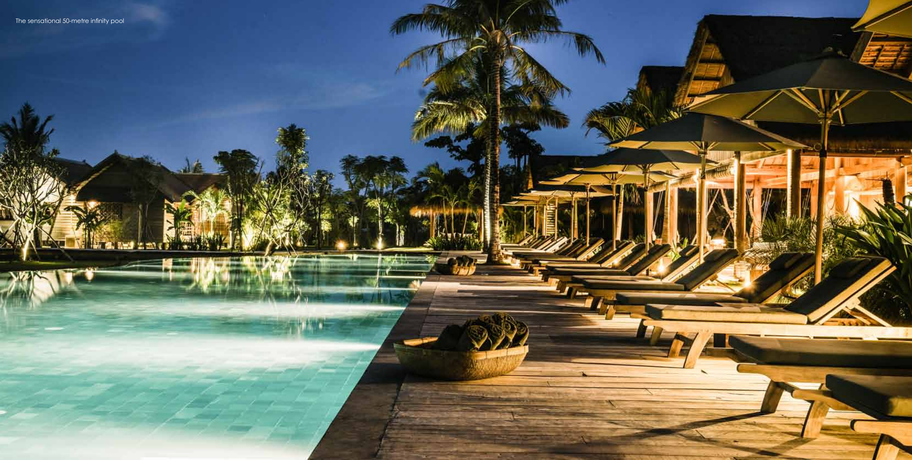
The sensational 50-metre infinity pool