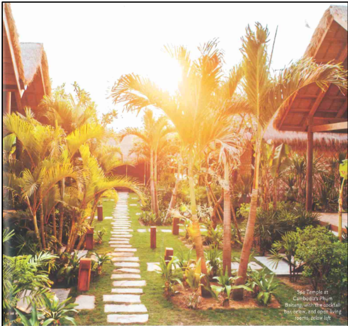
Spa Temple at Cambodia's Phum Baitang, with the cocktail bar, below, and open living rooms, below left