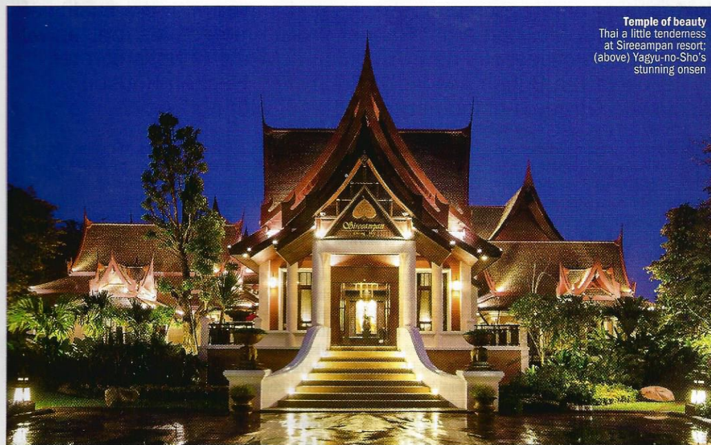
Temple of beauty Thai a little tenderness at Sireeampan resort: (above) Yagyu-no-Sho's stunning onsen