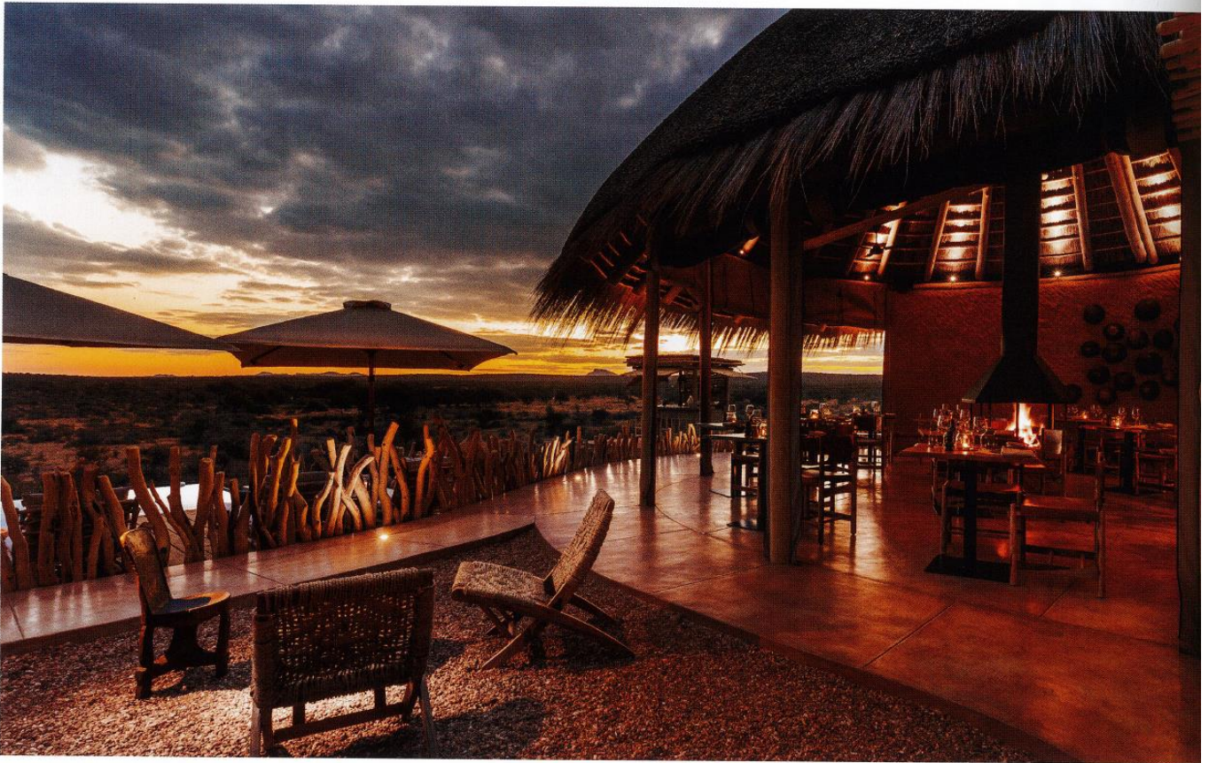
Above: Omaanda – along with many of Africa's lodges and tented camps – taps into a guest desire for conservation experiences

which is lit at night. Days are spent with Maasai guides who will take guests hiking down into the nearby Embaki crater to see flamingos resting on one leg in the salt lake, organise a game drive in the Ngorongoro crater to spot four of the big five, and pay a visit to a Maasai village to see how the tribe live.