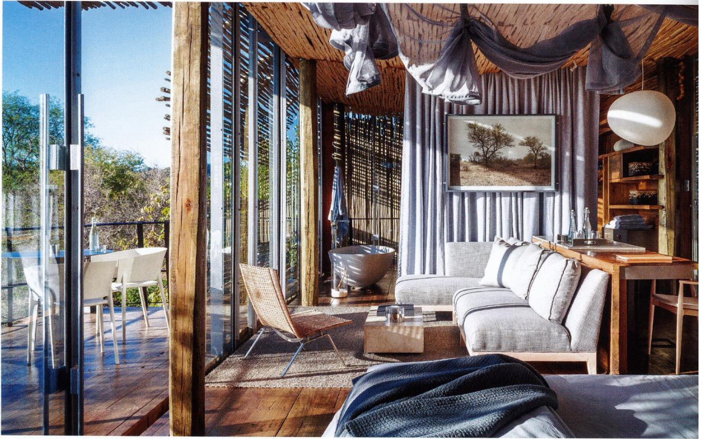
Above: Singita's Lebombo Lodge in the Kruger National Park will soon be joined by a new addition to the portfolio in Rwanda

Wilderness Safaris Chief Operations Officer explains: "Our interest in Rwanda began as long ago as 2009, when we started contemplating how our ecotourism model could contribute to the conservation of the Virunga Massif ecosystem and an iconic endangered species like the mountain gorilla. When we made the decision to invest in Rwanda, the last thing we intended to do was just to build a boutique lodge and sell gorilla treks. We wanted to ensure that our brand of responsible ecotourism made a real difference to both rural Rwandan people and biodiversity conservation."