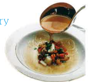
Namibian beef and vegetable soup

TRAVEL TIP: Partner your stay with a few days at Zannier's first Namibia project. At year-old Omaanda , a collection of 10 thatched-roof luxury huts in a wildlife reserve setting just outside Windhoek, game drives are all about spotting baboons, elephants, lions, and ostriches. From $610.