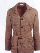
Brown houndstooth wool safari jacket DE PETRILLO