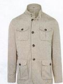
Cream safari jacket ISAIA