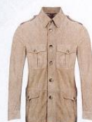
Sand unlined suede safari jacket ALFREDO RIFUGIO