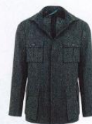
Green linen safari jacket B CORNER

A versatile safari jacket will take you from bush to bar.