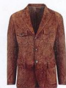
Brown suede safari jacket ALFREDO RIFUGIO